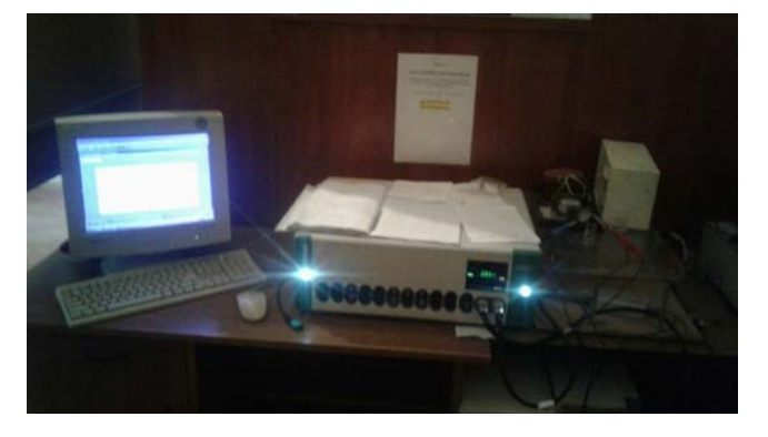
Figure 2. Laboratory installation of admittance measurements

element that is in direct contact with a physical quantity (its parameters) form an immittance sensor (primary transducer). Under the influence of the test signal parameters (level and frequency), it transforms a nonelectrical physical quantity into an electrical quantity of a capacitive or inductive nature.