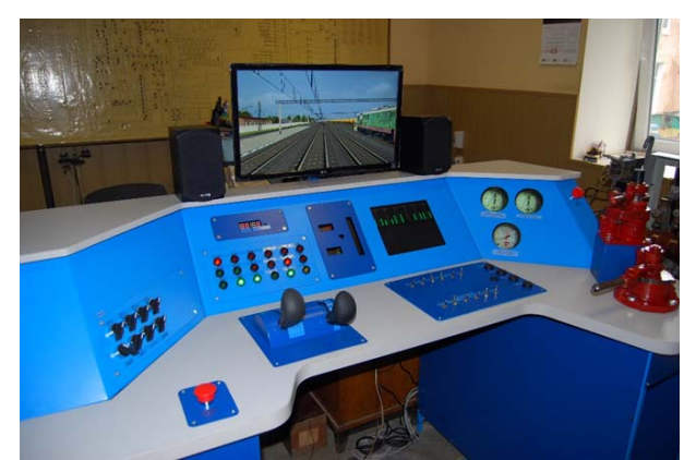
Fig. 2. Train driver's workbench.

More complex simulator (Fig. 2-4) including software and hardware devices was created by the team of K. Zhelieznov, O. Zabolotnyi, L. Ursulyak, Y. Chabanuk, A. Shvets, A. Akulov at Engineering and Design Specialised Department «Microprocessor-Based Control Systems and Safety in the Railway Transport» (EDSD MBCSS) of Dnipro National University of Railway Transport. Main purpose was to create the simulator allowing to train locomotive drivers in the conditions close to real [5, 13]. The simulator consists of two workbenches - for driver with locomotive control panel and for instructor. As it is known, various series of locomotives have different control panels, their controls are functionally similar, but structurally different from each other, thus, for simulators designed for various types and series of locomotives, reuse of the hardware is almost impossible. As for the software part, which includes a train model, a traffic segment model, a train situation management model, a locomotive system operation model, etc., here a lot of models can be reused with minor changes or without them at all.