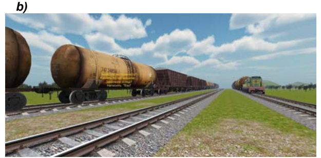
Fig. 3. Examples of the view from locomotive cab on driver's workbench: a) passing of train station, b) inspection of whole train and its elements using the function of outside view with the simulation of broken parts.