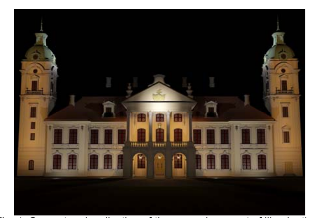
Fig. 4. Computer visualization of the second concept of illumination

The next proposal of a night exposure of Zamoyski Palace is the possibility of an accent specific "rhythm of elevation" of such baroque objects (fig. 5). This term refers to a certain pattern of repeatability of elements and other architectural details on the main elevation. It makes them appear in an orderly, cyclical array. The object was illuminated by luminaries of high power (250 W and 400 W) located at quite a long distance away. Each of them includes metal halide lamps with the colour temperature of daylight (approximately 6500 K). The rhythm of elevation was highlighted using the technology of light emitting diodes (LED's). This allowed for the miniaturization of the lighting equipment. This was done by illuminating the edges of the windows with small LED luminaries (3 W, luminous flux 126 Im). Their colour temperature of 2500 K was created in a virtual way. In fact, in a real setting, it could be achieved by using colour filters or RGB technology.