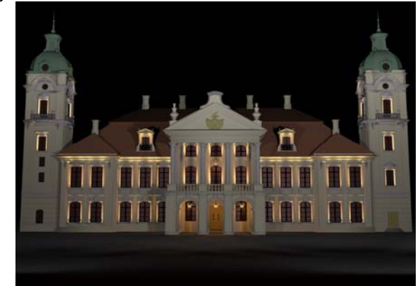
Fig. 5. Computer visualization of the third concept of illumination

The next concept highlights the baroque style of the palace (fig. 6). The lighting was designed to accent, in a natural way, the characteristic properties of this style. Linear luminaries with LED's were used. Their task is to expose the horizontality of the object and the fact that it is very wide. They are arranged along the main roof surfaces and also above the tympanum. The wings on the front elevation are illuminated by asymmetrical luminaries with metal halide lamps of 35W. Additionally, there are lighting accents on the pilasters. This is achieved by using ground-recessed rotationally symmetrical luminaries with 35 W lamps. The lower parts of the towers and domes are illuminated from a distance by 70 W luminaries. This concept is also used to achieve the illumination of the arcades and balconies. To do this, the existing large external chandeliers are used, with additional 35 W asymmetrical luminaries. Existing sources have also been exchanged for new ones with a colour temperature of 4000 K as in the other lighting equipment [5]. Moreover, to emphasize the dynamic of the baroque style [6], there are lighting accents on the edges of the windows, on the small balconies located on the towers and on the sculptures on the tympanum. The front surfaces of the arcades are also illuminated by two rows of rotationally symmetrical luminaries.