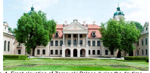
Fig. 1. Front elevation of Zamoyski Palace during the daytime

The illumination of objects is a relatively recent field of Lighting Technology. This term can be defined as "the effect of operations, which, by means of artificial lighting and other activities, expose an object at night time, especially visually" [1]. As the practice of lighting design shows, floodlighting is, in most cases, designed for those objects and buildings which are of historical significance and/or those which are distinguished from their surroundings by their sophisticated architectural structure. Zamoyski Palace in Kozlowka is definitely one of the latter objects. The aim of this article is to present the architectural and historical specifications of the Palace. It also aims to present the possibilities of illuminating this object by means of a modern method of lighting design – the computer visualization of lighting.