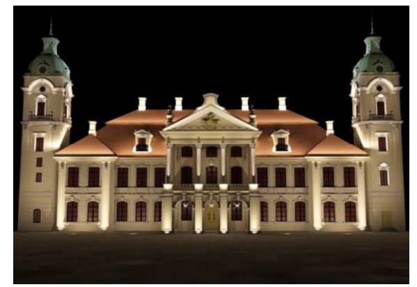
Fig. 6. Computer visualization of the fourth concept of illumination

The second concept (fig. 4) of illumination, based on separation of regions of elevations by using different colour temperature, is more ordered than the previous one. The different colours do not distract the observer, because of following standard procedure – the same or similar regions are illuminated in the same way. However, this image is not very consistent; there is too wide a separation of regions.