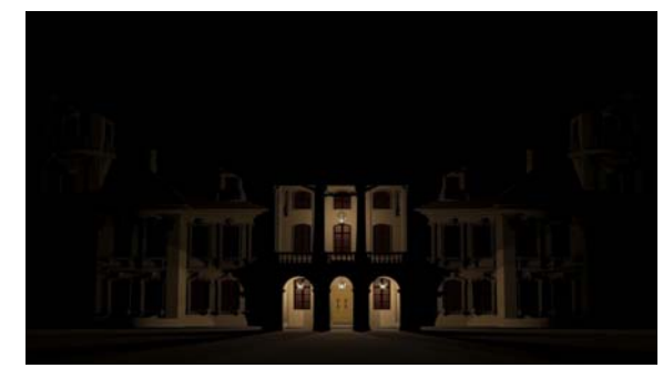
Fig. 2. Computer visualization of actual floodlighting of the object