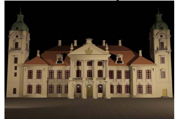
Fig. 3. Computer visualization of the first concept of illumination

The first concept for the illumination of Zamoyski Palace was based on the assumption of flooding surfaces of an object with artificial light [5]. It gives the greatest consistency to the final visualization. What is more, to avoid the effect of a negative, flattened image it incorporates the idea of asymmetrical shadows. This means that luminaries (of power 250 W and 400 W and a luminous flux of 20 000 Im) are located at a distance of 30 m from the object and are directed at a narrow angle to the front elevation. Metal halide lamps with a colour temperature of 4000 K are used. This effect of illumination is shown in figure 3.