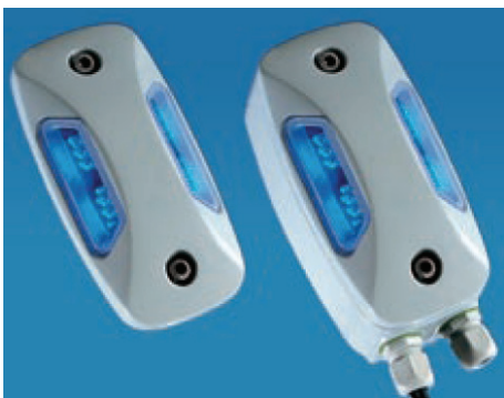
Fig.2. Example of LED tunnel exit emergency lighting [4]