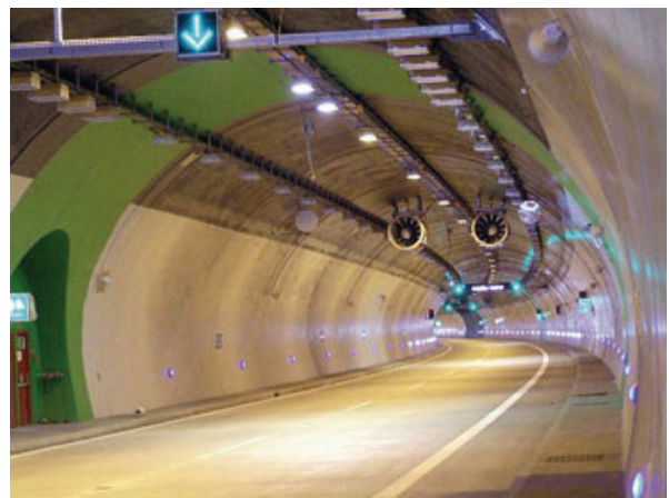
Fig.1. Klimkovice tunnel [3]

escape exit, it is called emergency escape lighting. It is used for lighting a fire escape routes in the tunnel. This emergency lighting in this case consists of 12W diode lights embedded in the holes in the lining on both sides of the tunnel tubes and serves as an indication and alarm function, as shown in Fig. Emergency lighting must correspond to prescribed values by TP98/2004 E_m = 2lx .